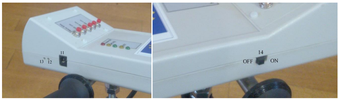
Figure 2. Instrument's charging components

In order to charge the instrument, connect the charger to the receipt (11) of the device. When the charger is connected, the red (12) and the green (13) indicator will illuminate. The green light indicates that the charger is connected correctly while the red that the battery is being charged. When the red light turns off, the battery is fully charged. ( Figure 2 ).