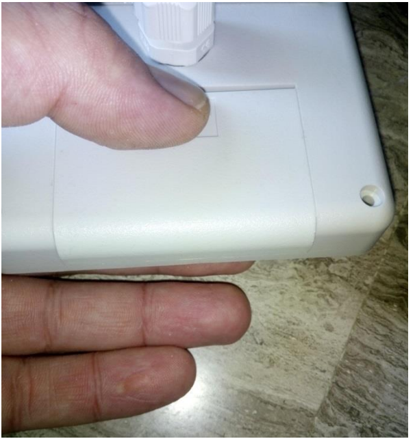
Figure 4. Instrument's protective cap removal

After that, gently push the SD card with your finger. You will hear a "click" and the card will be released ( Figure 5a ). Then, pull it back ( Figure 5b ) and insert it into the corresponding reader slot of the computer.