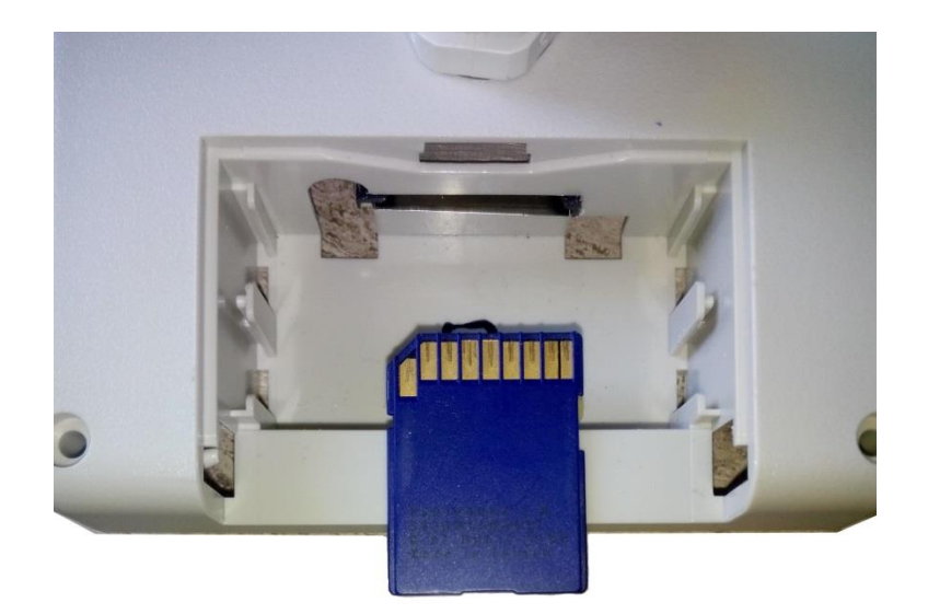
Figure 6. SD card insertion back to the instrument