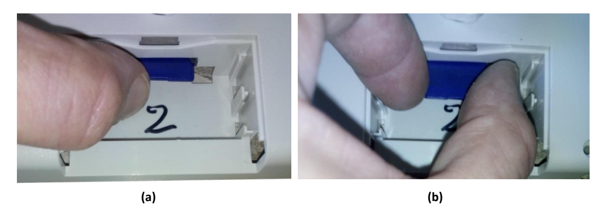
Figure 5. (a) Releasing and, (b) pulling out the SD card.

After that, gently push the SD card with your finger. You will hear a "click" and the card will be released ( Figure 5a ). Then, pull it back ( Figure 5b ) and insert it into the corresponding reader slot of the computer.