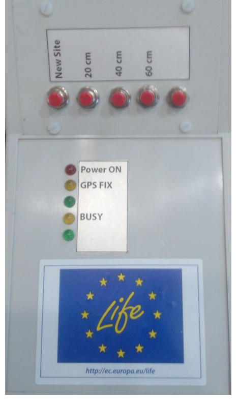
Figure 3. Instrument's control panel

7. Place deionized water into both containers of a ratio 5:1 (e.g. 50ml of water and 10g of soil) and stir until the soil completely dissolves.